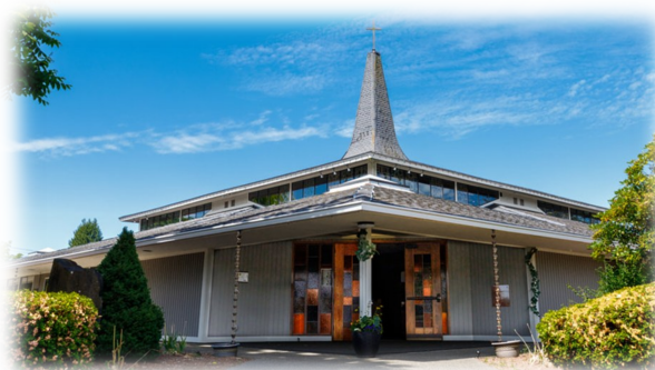
SANTA MARÍA DEL VALLE IGLESIA CATÓLICA